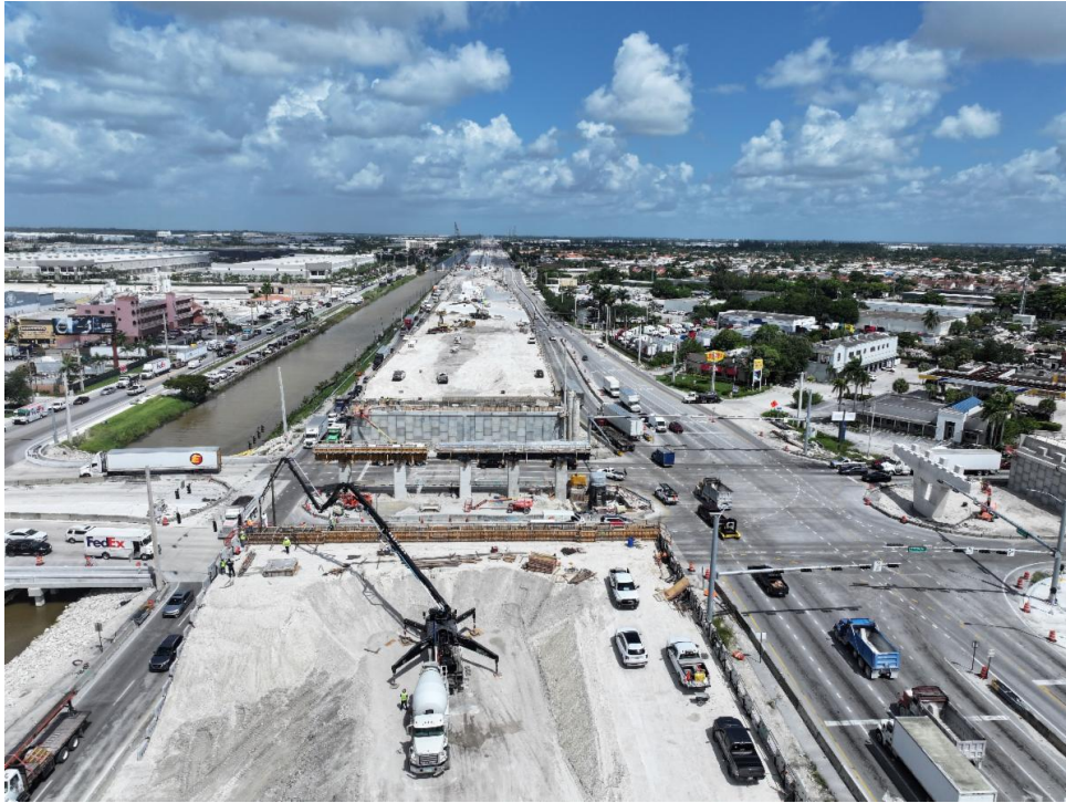
SR 25/US 27/Okeechobee Road at the NW 116 Way Intersection, facing the northbound/eastbound